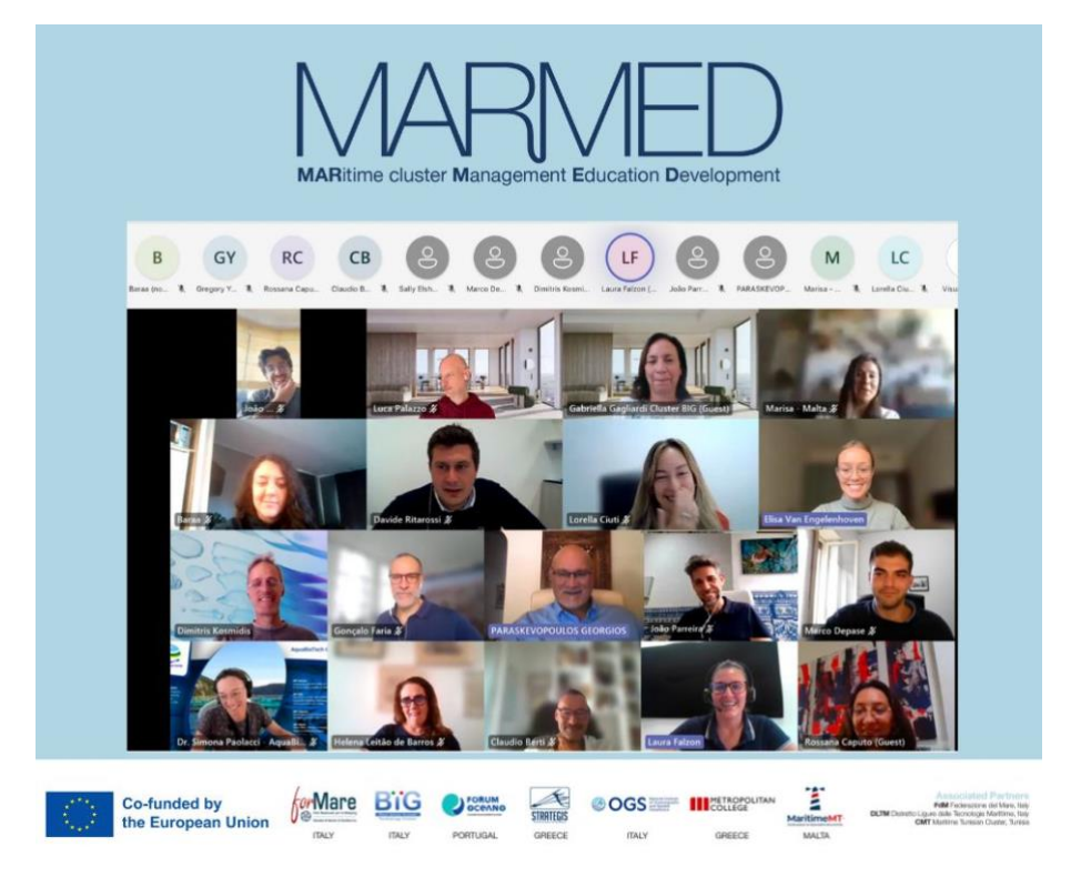
Figure 3. Online Live Discussions