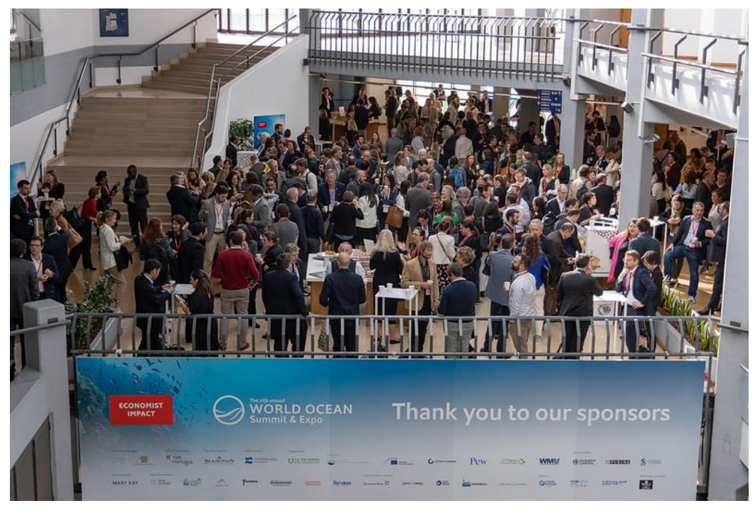
Figure 7. MARMED Presence at World Ocean Summit 2024 – Lisbon (Portugal)

By participating, MARMED gained visibility and opportunities for collaboration, strengthening its role as a driver of innovation and transformative change in the maritime sector. The event also reinforced MARMED's mission to build partnerships and shape the future of the ocean economy through upskilling, innovation, and cooperation.