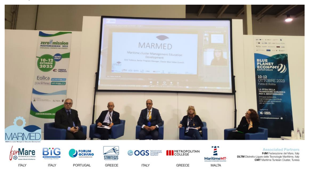
Figure 6. MARMED Project presented at the Blue Economy Expoforum - Rome (Italy)

actionable steps to address the skill needs for the sustainable development of the blue economy.