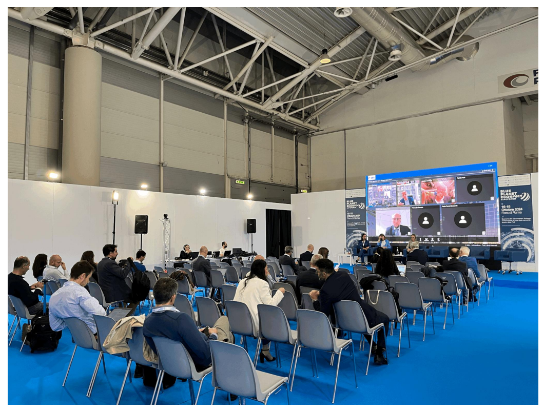
Figure 9. MARMED Project presented at Blue Planet Economy Expoforum 2024 – Rome (Italy)

The dedicated MARMED panel underscored the project's objectives in addressing skill gaps and enhancing the professional profile of Maritime Cluster Managers. It highlighted the importance of targeted training and capacity-building initiatives to ensure clusters' competitiveness and sustainability. This engagement reaffirmed MARMED's role as a catalyst for innovation and collaboration in the Mediterranean maritime sector.