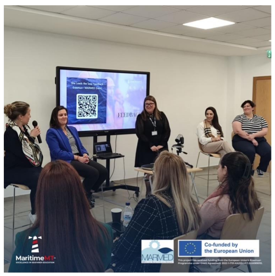
Figure 12. Maltese Multiplier Event

engagement on these critical topics, reinforcing the importance of addressing gender diversity within the Blue Economy.