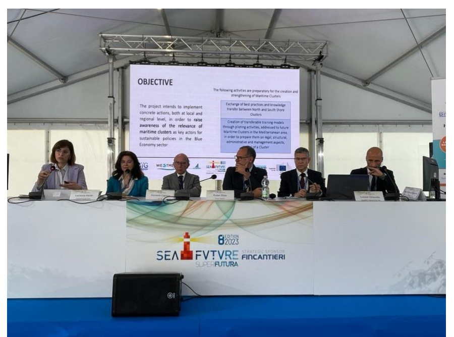
Figure 5. Presentation of MARMED Project at SEAFUTURE - La Spezia (Italy)

MARMED Project was presented by ForMare in the frame of the panel organized by the WestMED "Main Achievements of the WestMED Maritime Clusters Alliance and its members". The panel represented a good opportunity to present the result of the fruitful collaboration established with Maritime Clusters operating in the Mediterranean Area under the edge of the WestMED Alliance and to create synergies with similar projects. The panel was attended by representatives of major Institutions at national level – as the Italian Ministry of Foreign Affairs, Presidency of the Council of Ministers – Department for Cohesion Policies – and at EU level – as DG Mare and Union for the Mediterranean. The panel was attended also by the representatives of the main European and Mediterranean Maritime Clusters, the European Clusters Alliance and the European Network of Maritime Clusters, providing a good opportunity for the partners to raise awareness on the importance of MARMED Project at institutional level.