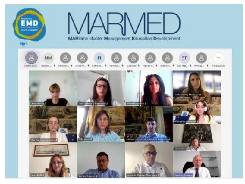
Figure 15. Joint Conference with UpSailing Project

introducing innovative training strategies for the development of green skills in maritime studies. The conference underscored the alignment of UpSailing with cutting-edge environmental policies at the EU level, promoting sustainable practices across the maritime sector. This opportunity of collaboration between MARMED and UpSailing highlighted the critical role of green skills development in driving the transition towards a more sustainable and inclusive Blue Economy. By sharing knowledge, resources, and best practices, this collaboration fostered a deeper understanding of how the maritime sector can contribute to environmental sustainability, while also ensuring that future professionals operating in the Blue Economy sectors are equipped with the necessary expertise to support green policies and initiatives. Furthermore, this collaborative approach ensures the long-term sustainability of the project by building a strong foundation of shared commitment and continued engagement among stakeholders.