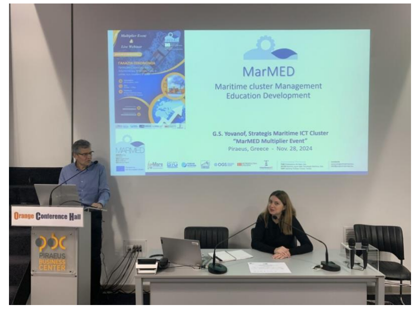
Figure 14. Greek Multiplier Event

Economy. The MARMED Project's achievements were highlighted, particularly the successful implementation of online courses and the enriching study visit to Trieste. Discussions also centred on sustainability in the cruise industry and freshwater resource management, two areas where maritime clusters are playing an increasingly significant role. The roundtable discussion with MARMED participants emphasized the program's value in preparing future Cluster Managers to lead regional competitiveness and innovation efforts. The Greek event reaffirmed the importance of clusters as hubs for knowledge exchange and catalysts for long-term sustainable development.