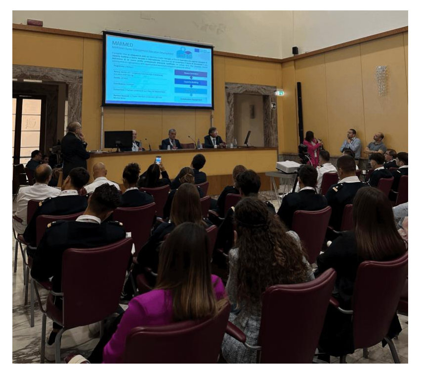
Figure 8. MARMED Project presented at the Naples Shipping Week 2024 – Naples (Italy)