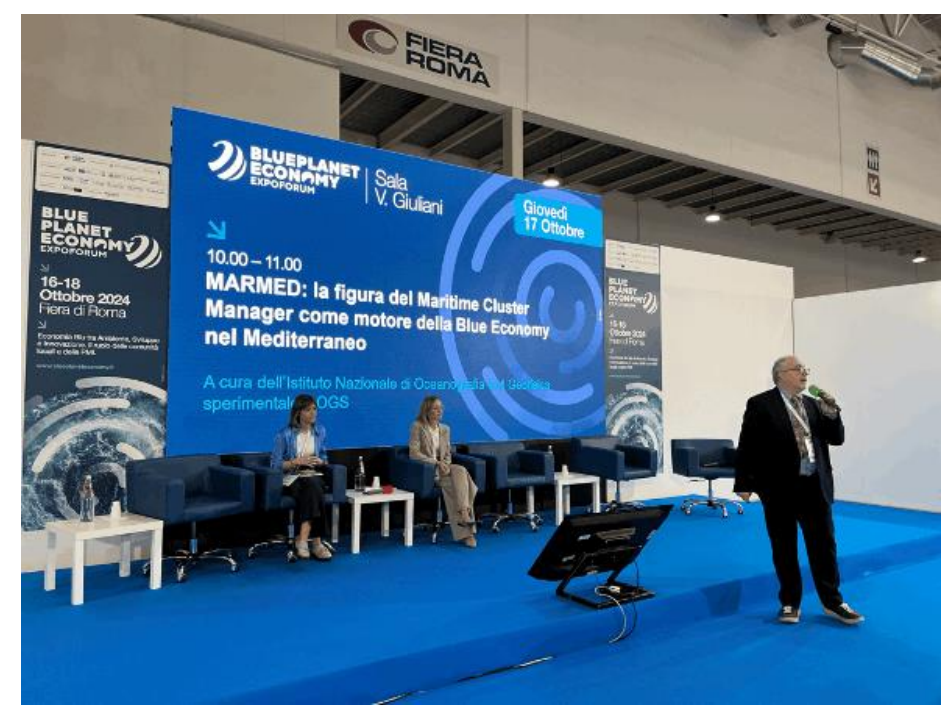
Figure 11. Italian Multiplier Event