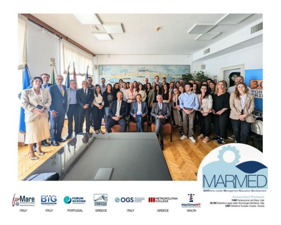
Figure 2. Study Visit in Trieste

managers. Participants praised the networking opportunities, the quality of the conferences, and the presentations, which enriched their learning experience and fostered meaningful connections. The Study Visit successfully created a dynamic environment for knowledge exchange by bringing together experts and participants. This feedback underscores the importance of maintaining and enhancing opportunities for interaction and well-structured content in future activities involving Maritime Cluster Managers.