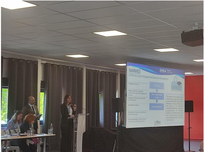
Figure 4. Presentation of MARMED Project at EMD 2023, Brest (France)

The workshop was also selected by the European Commission as associated event of the European Year of Skills 2023 , an initiative promoted by the European Commission to promote skills development and to address skills gaps in the European Union and boost the EU skills strategy.